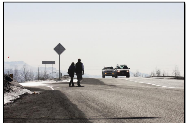
Approximately one-third of pedestrians do not follow the designated route.

Public outreach will continue throughout construction of the DDI to familiarize the public with motorized and non-motorized use of the new interchange.