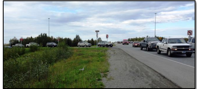
Traffic on Muldoon Road backs up during peak hours.

In the Spring of 2016 the Alaska Department of Transportation & Public Facilities (DOT&PF) will begin construction of upgrades to the Glenn Highway and Muldoon Road interchange. As an intersection of two National Highway System roads that serves more than 80,000 cars per day, this interchange is vital to traffic flow in East Anchorage and to/from Joint Base Elmendorf-Richardson.